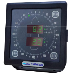
HLD-AMD601 Wind Repeater