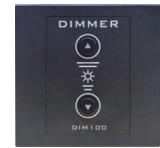
DIM100 Remote Dimmer